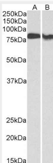
AF3791a (0.3 µg/ml) staining of Human Placenta (A) and Rat Brain (B) lysates (35 µg protein in RIPA buffer). Primary incubation was 1 hour. Detected by chemiluminescence.